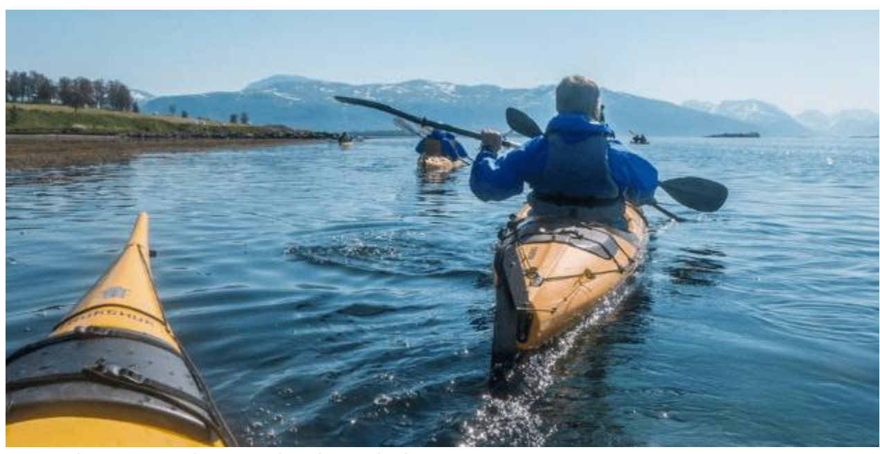
Expand your Northern Lights knowledge