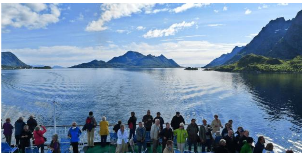
Welcome to Lofoten

Location: Vesterålen and Lofoten Islands