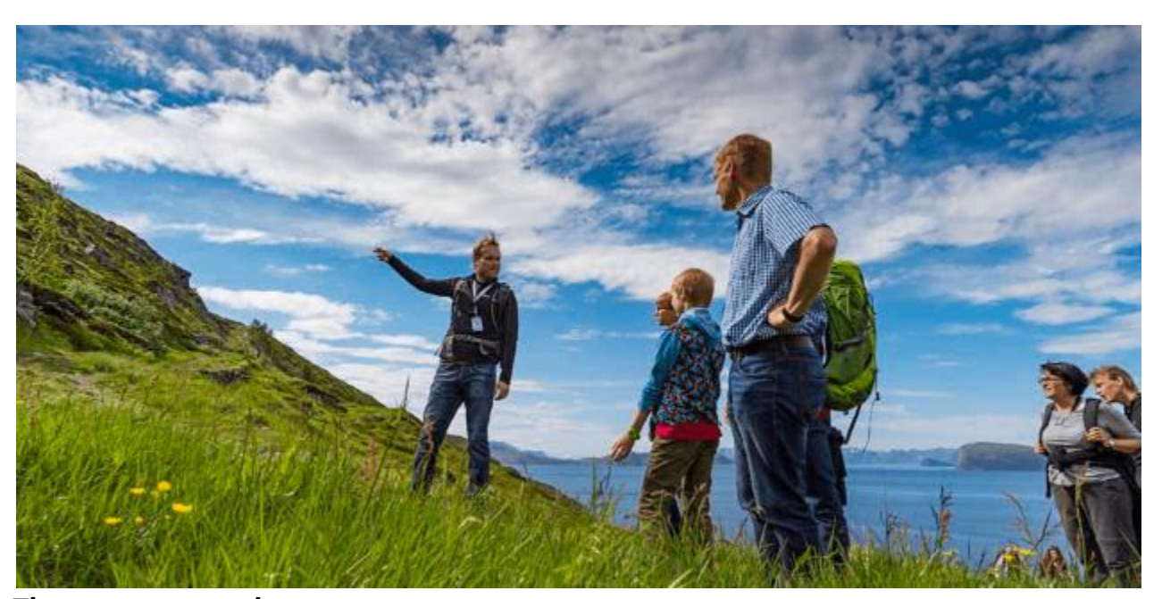
The extreme north