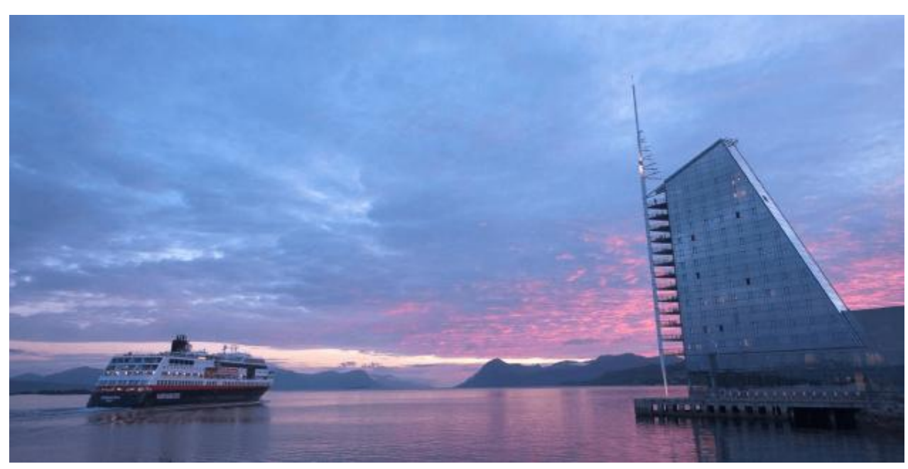
A day for masterpieces