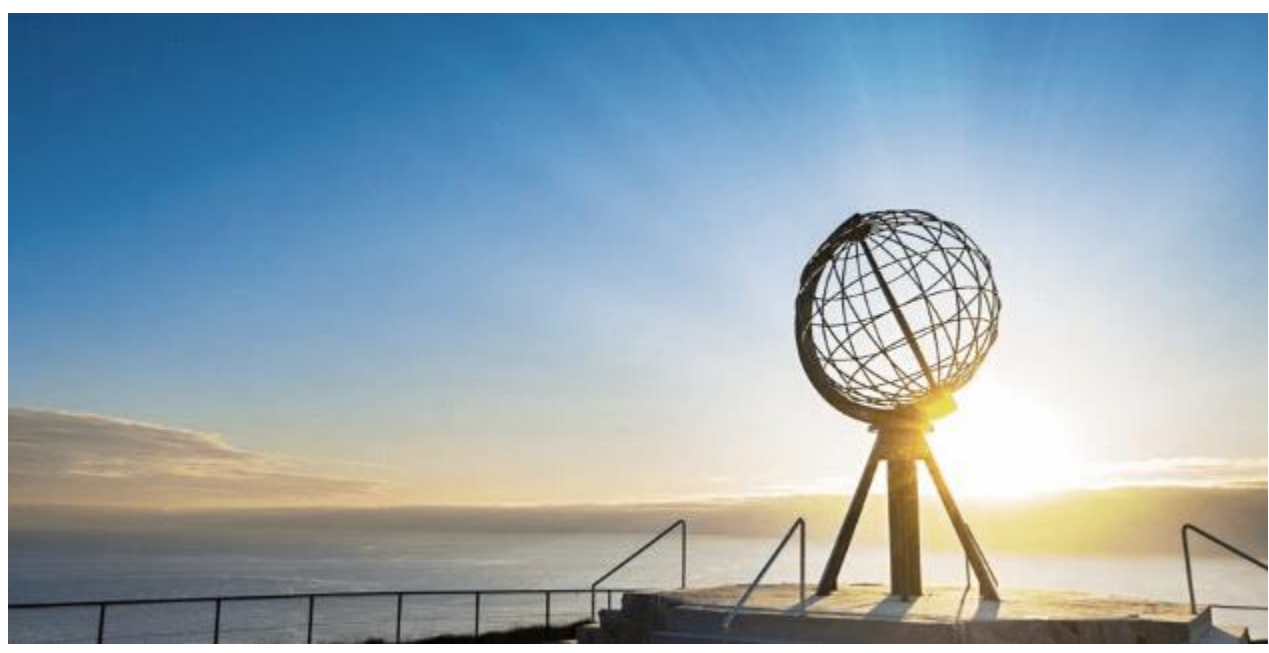
The Northern Lights and the North Cape