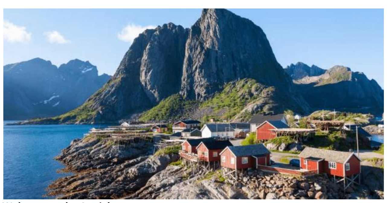
Welcome to the Arctic!

Location: Arctic Circle and Lofoten Islands